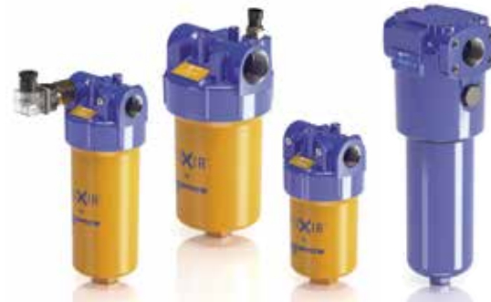
Elixir: the new generation of low pressure in-line filters