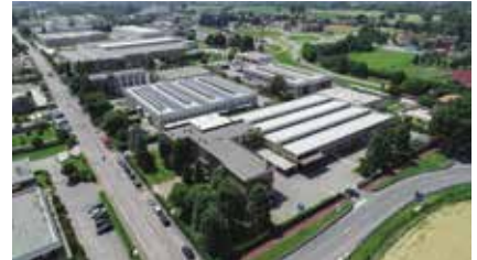
Power Transmission Division - Manufacturing plant