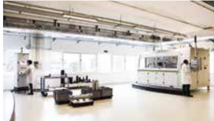
MP Filtri Research and Development Center