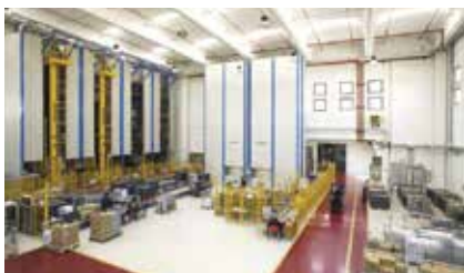
Automatic warehouse system in Pessano con Bomago plant