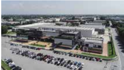
MP FILTRI Headquarters in Milan